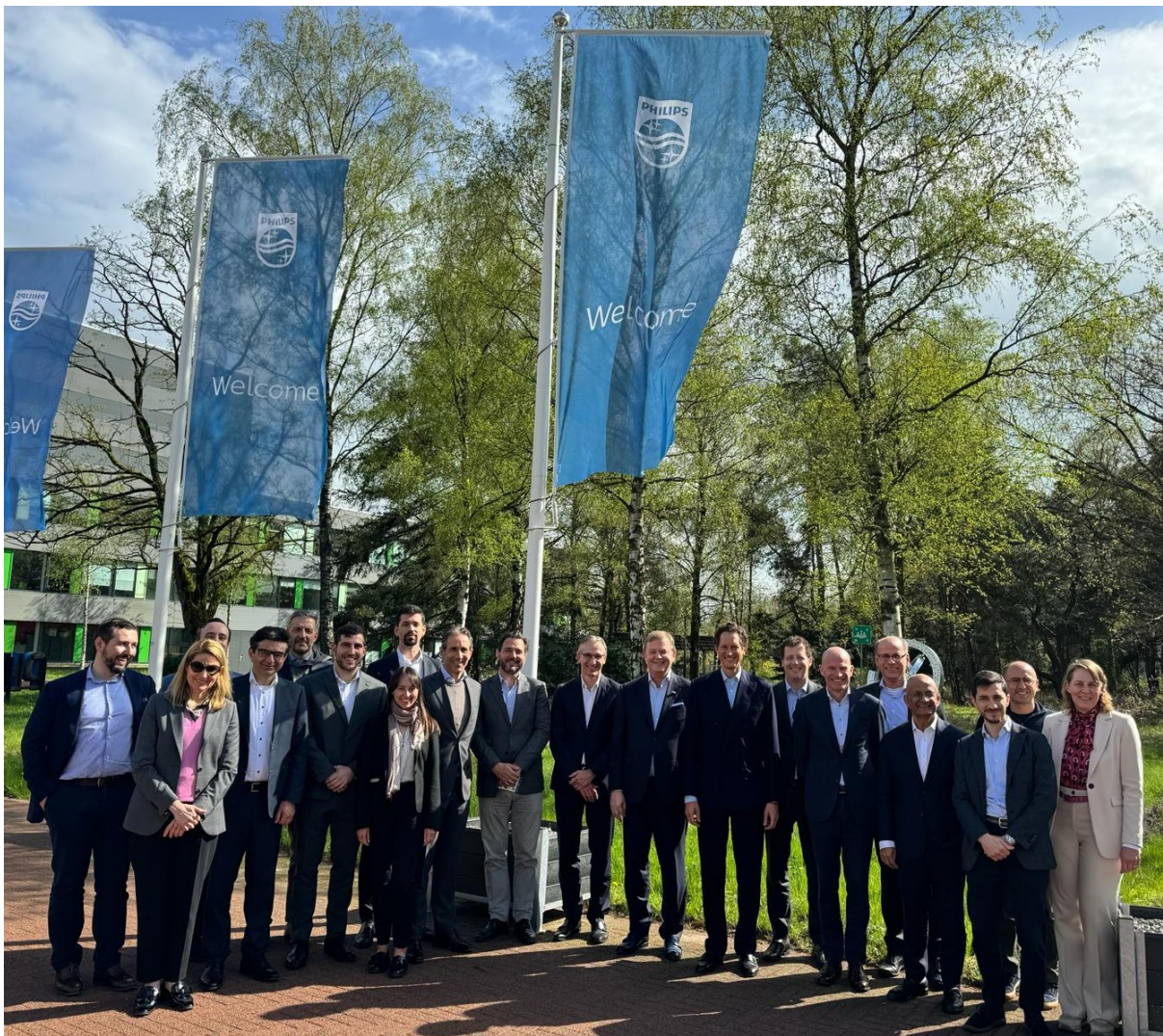
The Exor team receives a warm welcome at the Philips Innovation Center Eindhoven

In terms of governance, our discussions with Feike Sijbesma, Chair of Philips, increased our conviction that he and the Board were tackling head-on the challenges the company was facing with a clear agenda of change. When looking at leadership, Roy Jakobs, who began his role as CEO in October 2022, and his largely renewed and experienced team have a clear plan to address company-specific issues and implement the required cultural and organisational changes to drive profitable growth.