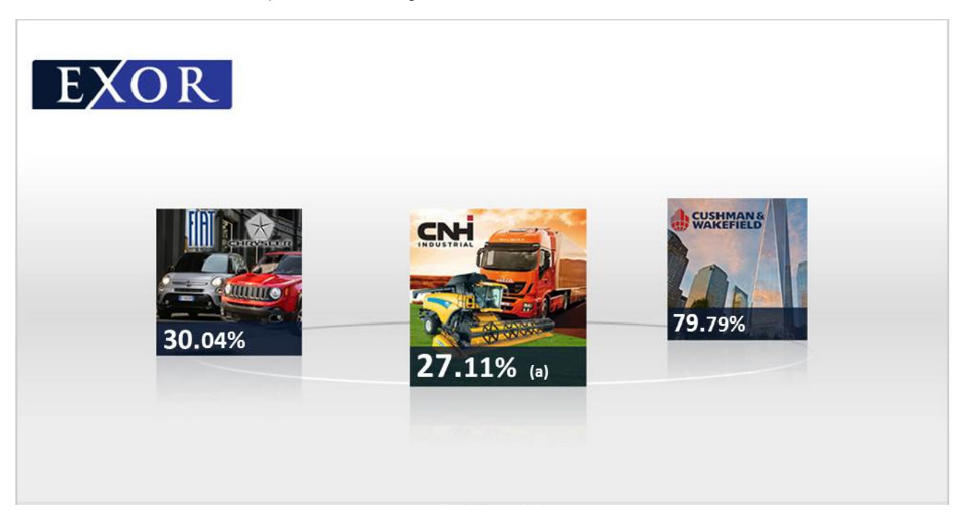
(a) EXOR holds 40.15% of the voting rights. In addition, Fiat holds a 2.49% stake and 2.83% of the voting rights.

Investments of the EXOR Group are the following: